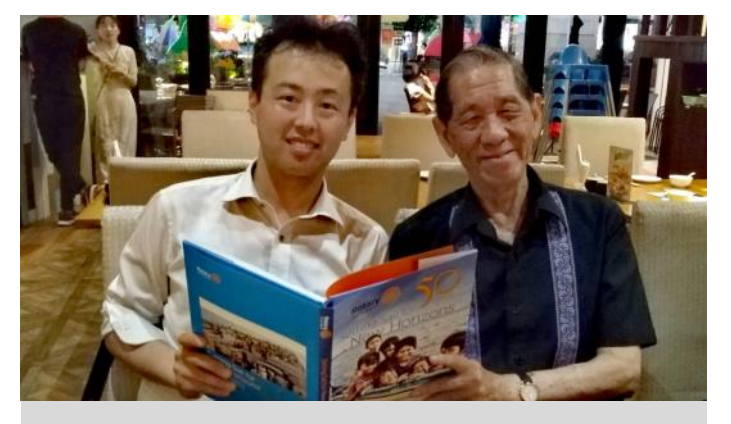
PP Summer Fellowship?