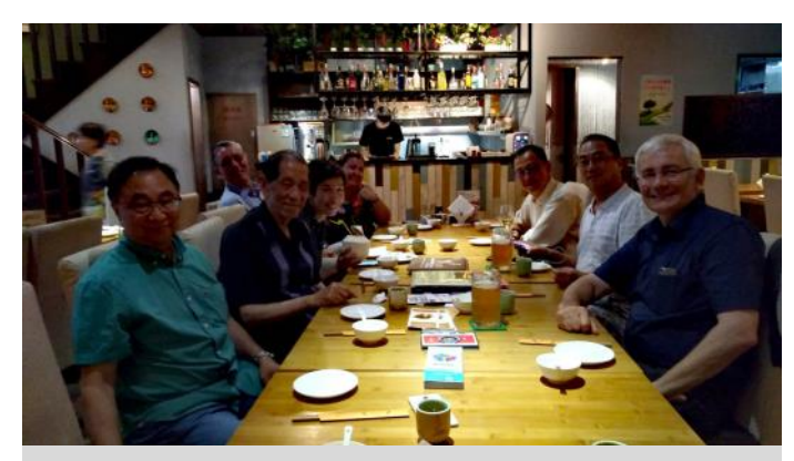
Left side of the table