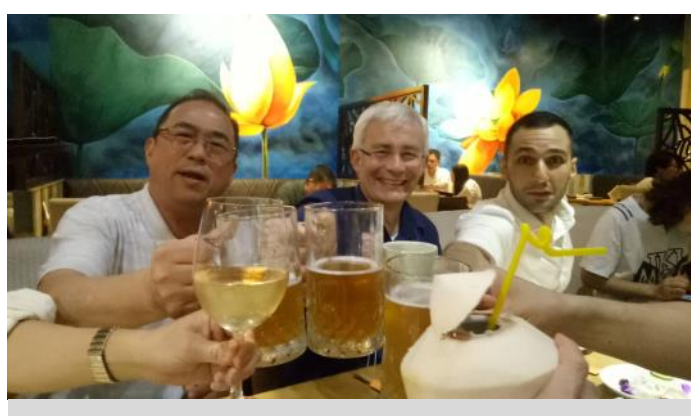
Celebrating the last Summer Fellowship Dinner of 2018